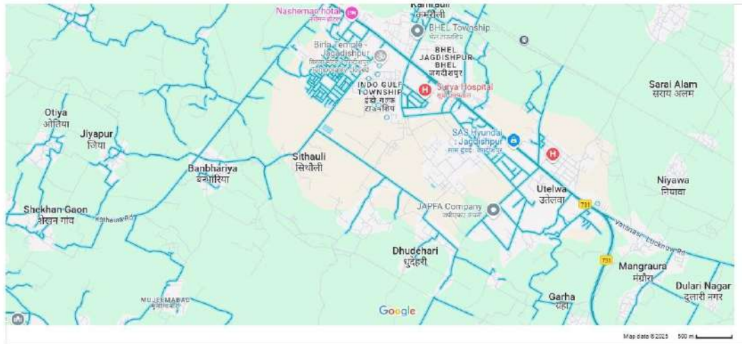
Utelwa - Google Maps